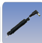
E-DC-6 12V Cable Without Adapter Plug