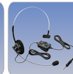
VC-24 VOX Headset