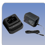
VAC-370B Rapid Charger