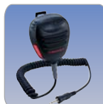
CMP460 Noise Canceling Waterproof Speaker/ Microphone