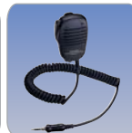
MH-57A4B Speaker/ Microphone